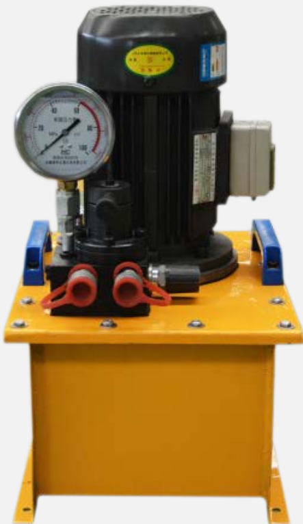
220v/380v Electric Pump